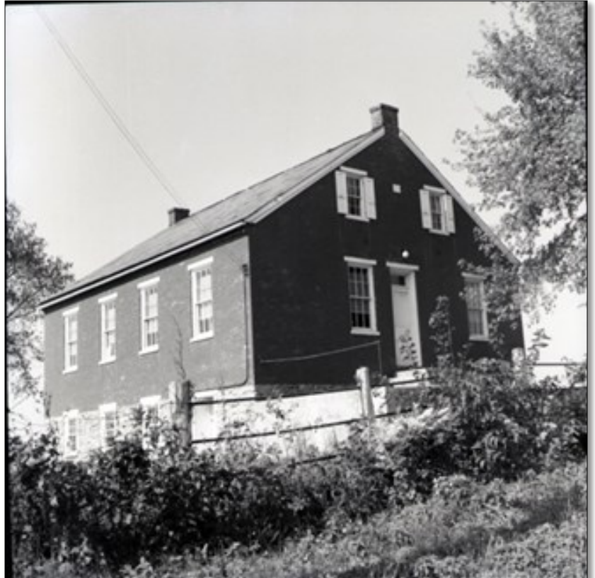
MANOR MEETINGHOUSE 1950

The brick structure measured 36 by 40 feet and, unlike many older meetinghouses, used one entrance door for both men and women.