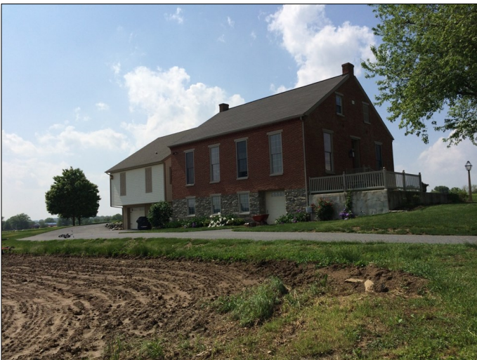
MANOR MEETINGHOUSE AS IT APPEARS TODAY, A PRIVATE RESIDENCE

Beside the meetinghouse was erected a cemetery, which is maintained today by the Mountville Church of the Brethren. Occasional special worship services were held at Sheep's Lane even after the new Mountville church was built in 1962. Eventually the meetinghouse was rented to two different Baptist groups. The latter group of Baptists moved to a larger structure, and the Mountville congregation sold the property early in this century for use as a private residence. The photograph demonstrates a modern edition that was added by the owners.