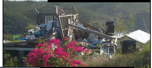
PREPARING TO CLEAN UP