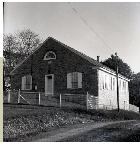
Merkey Meetinghouse 1950