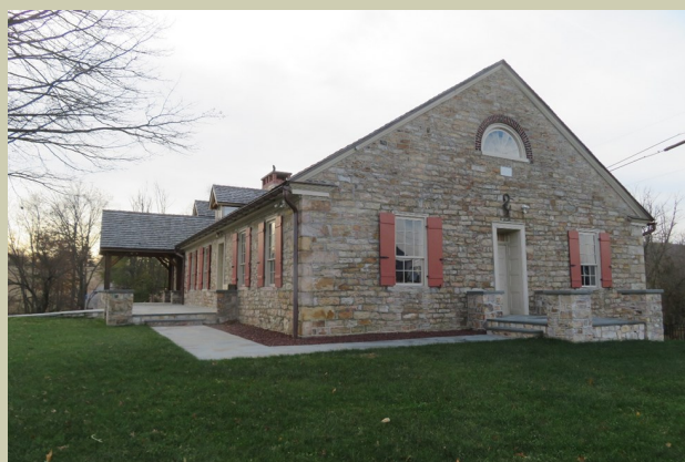
Merkey Meetinghouse today

Built in 1848, it served the congregation well into the 20 th century. It's demise as a meetinghouse came when the modern Little Swatara church facility was built in 1963. After being sold, it was for a time a private residence, then was vacant. In