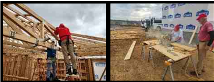
Volunteers from Spring Creek serving in Dawson Springs- March 2024

IN 2023, 11 CHURCHES AND 109 VOLUNTEERS FROM THE ANE DISTRICT SPENT A WEEK SERVING WITH BRETHREN DISASTER MINISTRIES IN TORNADO RECOVERY IN DAWSON SPRINGS, OR FLOOD RECOVERY IN EASTERN KENTUCKY (BREATHITT COUNTY).