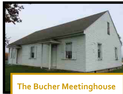
The Bucher Meetinghouse

ANE STEWARDSHIP COMMISSION IS RESPONSIBLE FOR THE MAINTENANCE OF THE BUCHER MEETING HOUSE PROPERTY AND BUCHER CEMETERY IN LEBANON COUNTY. THIS COMMITTEE IS COMPRISED OF ANE TREASURER, ANE STEWARDSHIP COMMISSION MEMBER, ANE HISTORICAL COMMITTEE MEMBER OR APPOINTEE, AND 3 AT-LARGE MEMBERS APPOINTED AND APPROVED BY ANE BOARD.