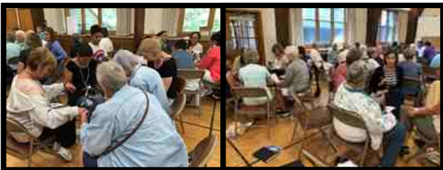
WOMEN'S CAMP 2023 PHOTOS (LEFT) AND SPRING FELLOWSHIP 2024 (ABOVE)