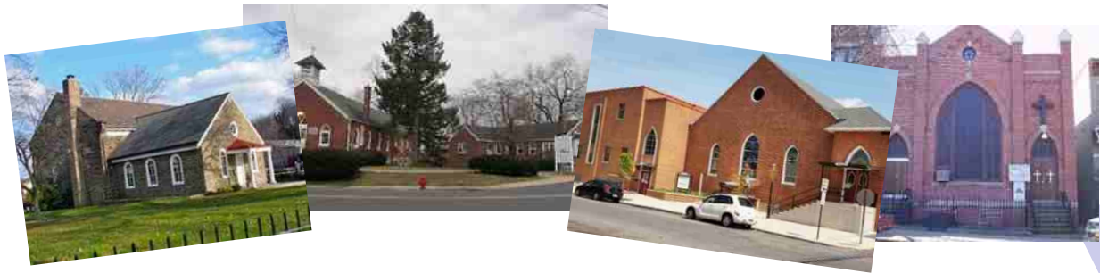
Germantown, Alpha & Omega, Harrisburg First, and Brooklyn First receive annual funding

ANE DISTRICT CHURCHES, SMALL GROUPS AND INDIVIDUALS ARE ENCOURAGED TO GENEROUSLY SUPPORT THIS FUND THAT PROVIDES SUPPORT TO THE MINISTRY OF THESE ANE DISTRICT URBAN CHURCHES. A SEPARATE UP TO DATE FINANCIAL REPORT FOR THIS FUND WILL BE AVAILABLE AT DISTRICT CONFERENCE .