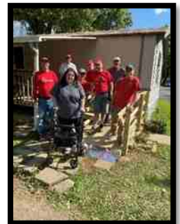
Volunteers build ramp

IN APRIL 2024, LEBANON COB RECEIVED $5,000 FROM THIS FUND AS THEY SUPPORTED A MEMBER OF THEIR CHURCH FAMILY WHO NEEDED FINANCIAL ASSISTANCE DURING A TIME OF RECOVERY FROM KNEE REPLACEMENT SURGERY.