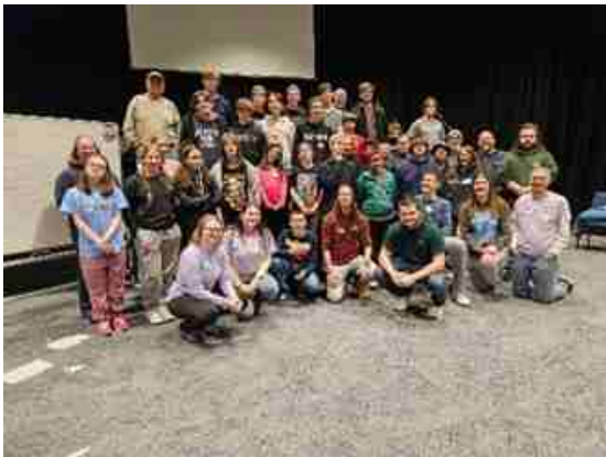
Lancaster Retreat Participants

IN JANUARY, LANCASTER HOSTED A WEEK-END RETREAT UNDER THE LEADERSHIP OF THE INTERDISTRICT YOUTH CABINET —A GROUP OF BRIDGE-WATER AND BLUE RIDGE COLLEGE STUDENTS. THE WEEKEND FOCUS WAS TO BRING TOGETHER YOUTH FROM THE ANE DISTRICT FOR A FUN, INEXPENSIVE RETREAT FOR BOTH JR AND SR HIGH YOUTH! ATTENDEES SLEPT AT THE CHURCH AND PARTICIPATED IN A SERVICE PROJECT ON SATURDAY MORNING.