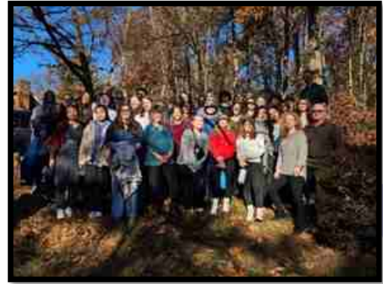
Washington DC Service Weekend Participants

LAST NOVEMBER, YOUTH FROM 4 CHURCHES PARTICIPATED IN A SERVICE WEEKEND IN WASHINGTON DC , PARTNERING WITH ST STEPHENS BAPTIST CHURCH, WIDOWS PANTRY AND WIDER CIRCLE. THERE WERE 24 YOUTH AND 16 ADVISORS FROM HEMPFIELD, LITITZ, LEBANON AND STEVENS HILL COMMUNITY CHURCHES.