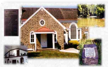
The Germantown Trust