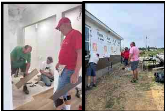
Left: Volunteers from Lititz and Wilmington in Dawson Springs—Fall of 2023